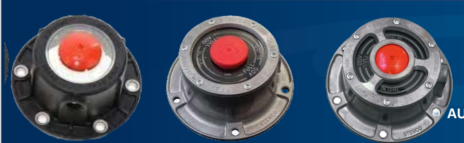
Composite DEFENDER 366-****