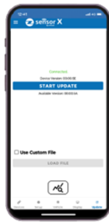
FULLY UPDATABLE FIRMWARE FROM TRANSCIEVER MODULES & MONITORS