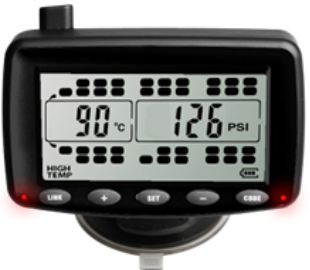
HIGH TEMPERATURE WARNING! AUDIBLE & VISUAL SENSOR POSITION, HIGH TEMPERATURE & RED LED'S WILL FLASH