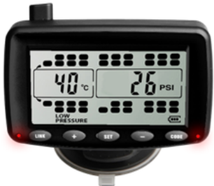
EXTREME LOW PRESSURE WARNING! AUDIBLE & VISUAL SENSOR POSITION, LOW PRESURE & RED LED'S WILL FLASH