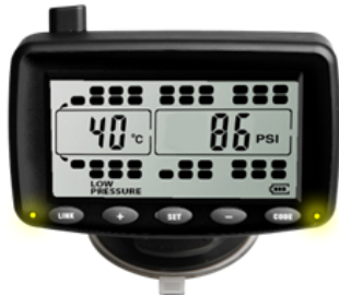
LOW PRESSURE WARNING! AUDIBLE & VISUAL SENSOR POSITION, LOW PRESURE & AMBER LED'S WILL FLASH