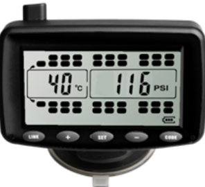
ALL TYRE PRESSURES & TEMPERATURES ARE OK