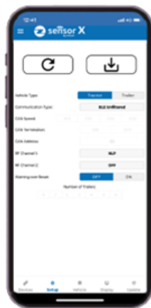
FULLY CONFIGURABLE TRANSCIEVER COMMUNICATION TYPE, ASSET TYPE, NUMBER OF TRAILERS, ETC.