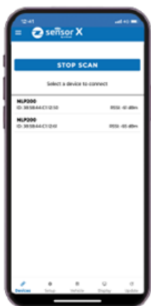
SCAN & CONNECT TO TRUCKS & TRAILERS WITHIN RANGE