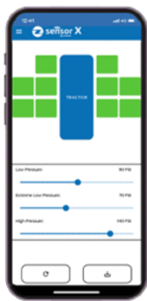
CUSTOMISABLE ALERT SETTING LOW PRESSURE, EXTREME LOW PRESSURE, HIGH PRESSURE & HIGH TEMPERATURE