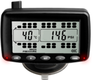
HIGH PRESSURE WARNING! AUDIBLE & VISUAL SENSOR POSITION, HIGH PRESSURE & RED LED'S WILL FLASH